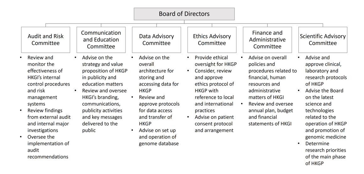
Figure 1. Governance of the Hong Kong Genome Institute. HKGI is overseen by the Board of Directors and six Advisory Committees for effective implementation of HKGP. HKGI: Hong Kong Genome Institute; HKGP: Hong Kong Genome Project.